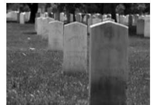
Send to Grave Marker Chairman