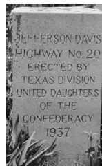
Send to Jefferson Davis Highway Chairman