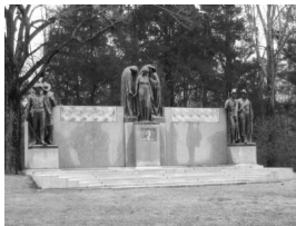
Monuments Submit on this form